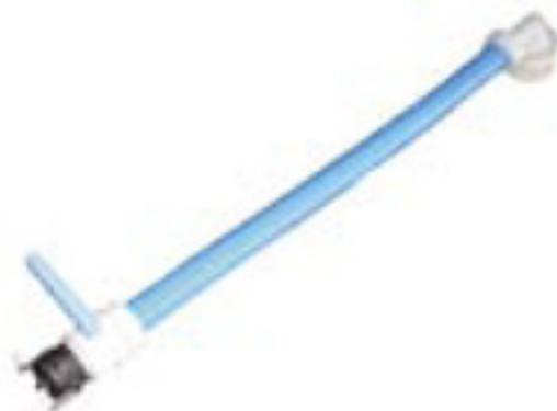
Top filling hose with 2ins camlock at the end

Büscherhoff co-operates with several forwarders, which provides the opportunity of finding special packaging solutions. The company made a name for itself in the market and production of multi-layer flexitanks. As the flexitank is one-way packaging, it is easy to recycle them without further cleaning costs involved. The used flexitanks