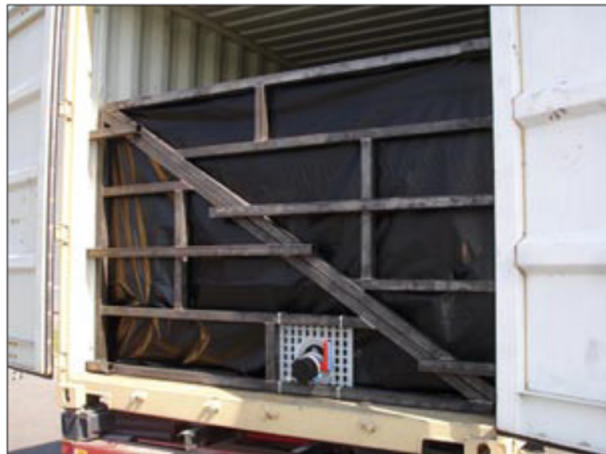
Flexitank installed into a container with bottom discharge and specially designed reusable 'delta steel frames'

Büscherhoff's top loading/discharge system is also an original product, only the hose is still delivered from an external supplier. The parts were solely developed for the application on flexitanks. Büscherhoff has also developed two further steel bulkheads, such that the company can now offer four differ-